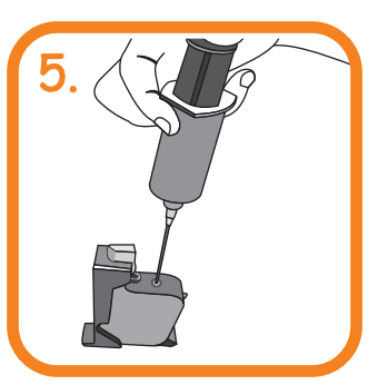
Insert needle slowly into cartridge and inject 40ml of ink. Avoid puncturing the ink bag.