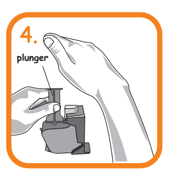
Place tip of plunger on metal ball and hammer plunger to push ball into cartridge.