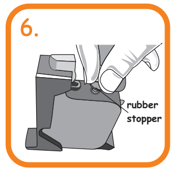
Seal hole with rubber stopper provided.