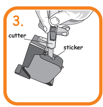
Remove sticker with the cutter.