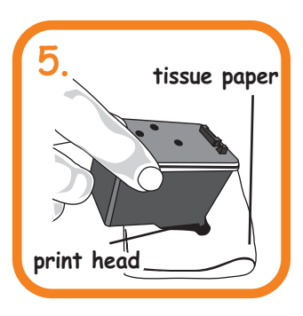
Clean print head by stamping gently on tissue paper.