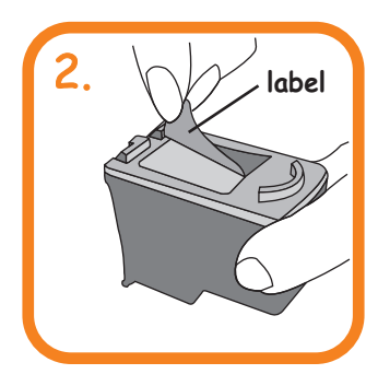
Remove the label on the cartridge.