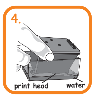
Dip the print head of the cartridge into water for 10 seconds.

Push the needle straight into the cartridge and pull out a little (2mm). Slowly press the plunger to inject ink into the cartridge. Ensure cartridge is in upright position. Stop filling if ink start to drip at print head.