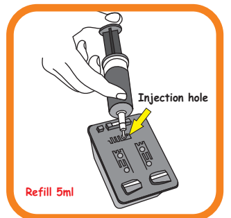
Refilling for HP 60/92/702

Push the needle straight into the cartridge and pull out a little (2mm). Slowly press the plunger to inject ink into the cartridge. Ensure cartridge is in upright position. Stop filling if ink start to drip at print head.